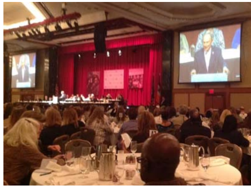
NYC Mayor Bloomberg addressing to our group at The National Community Action Conference